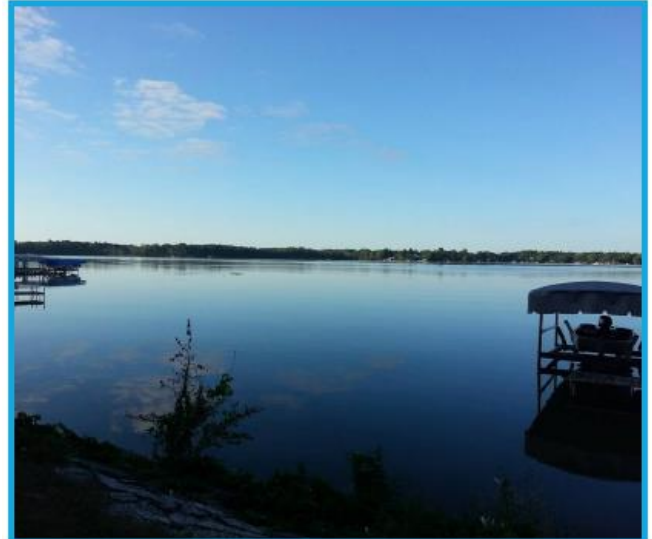
Oconomowoc Lake at Dusk