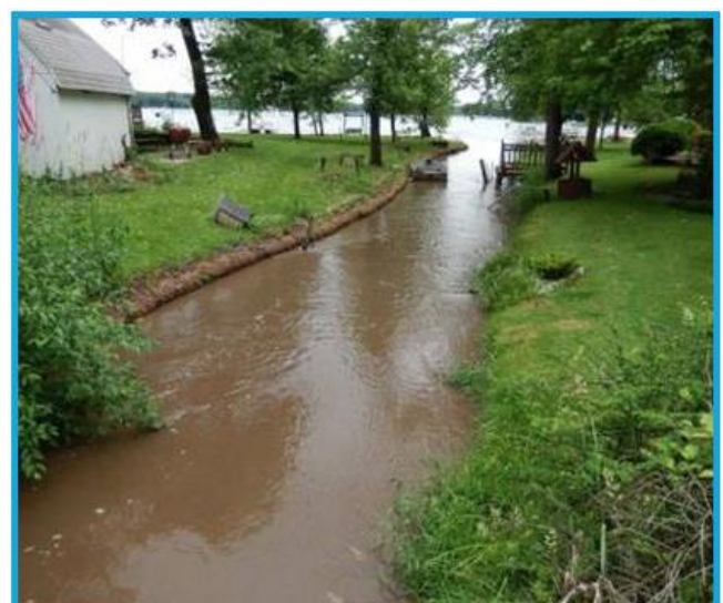
Siltation After Heavy Rains in Mason Creek Flowing into North Lake